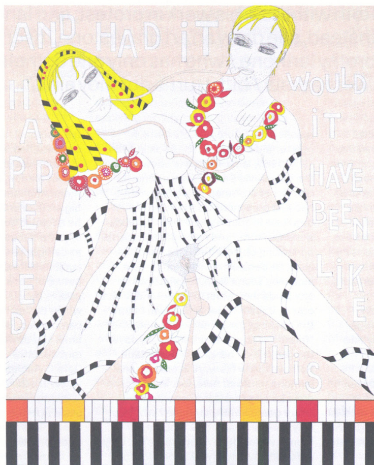
Bottom: Dorothy Iannone, My Beautiful Laundrette , 2014. Gouache and acrylic on paper on wood, 16.73 x 21.46 x 7.87 in. (42.6 x 54.5 x 20 cm).