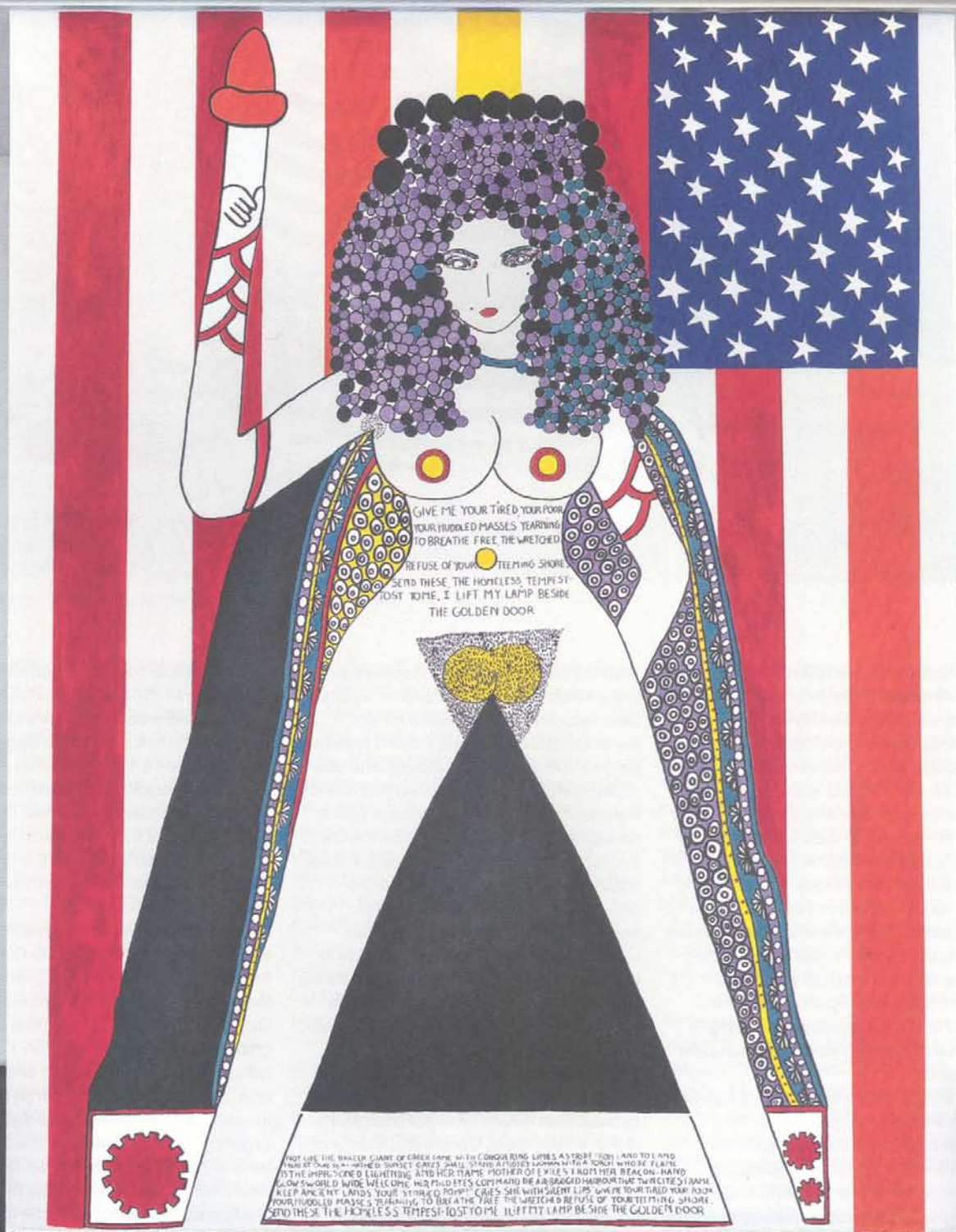
Dorothy Iannone, The Statue of Liberty , 2019. Acrylic on wall, dimensions variable. As shown, 140 x 104 in. (355 x 265 cm). Ed. of 3 plus 1 AP.